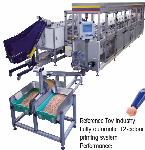
Reference Toy industry: Fully automatic 12-colour tampon printing system Performance: 24.000 printing parts/h