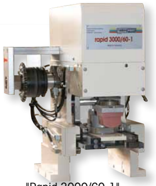
"Rapid 3000/60-1" Built-in model for automations, for external drive