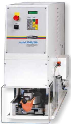
"Rapid 2000/130" Floor standing model